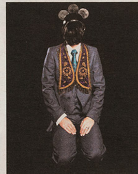
Portrait: One of Thea Costantino's unsettling images, Ancestor III .

elements of beauty. This is seen in McFarlane's exquisite paintings of dead birds, Thea Costantino's unsettling portraits, Eva Fernandez' native flora pictured against a black void and Nicholls' drawings and ceramics with a darkly humorous edge.