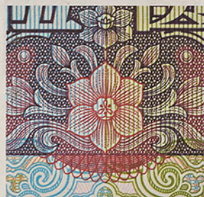
Detail: Marcel Cousins' Lotus Flower .

Exploded Diagram and Florid are at Turner Galleries, William Street, Northbridge, until August 2.